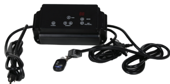
Transformer (50W) with Bluetooth capability and solar cell for automatic power-on at dusk and dimming